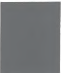
DARK GRAY 1 LB 8084 * or 5 LBS 860

The natural base color of concrete, finishing and curing method determines final color. This card simulates lab samples made with a light broom finish from Type II gray cement, sand and water at 0.56 water/cement ratio for a 4" slump (see uncolored reference at left). Different cements, sand, rock, mixing and job-site conditions and contractor technique can alter color from this card. Concrete is produced from natural materials. Surface variation common to uncolored concrete can impact colored concrete.