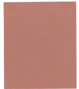
BRICK RED 4 LBS 160