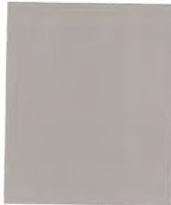
OUTBACK 0.5 LB 677