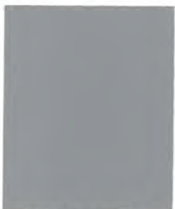
SILVERSMOKE 0.25 LB 8084 * or 1.25 LBS 860

(Dry dose rates shown, liquid dose rates higher)