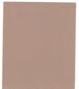
YOSEMITE BROWN 2 LBS 641

Color name, number and dose-rate to mix with each 94 lb. sack of cement.