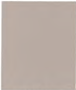
PEBBLE 0.5 LB 641