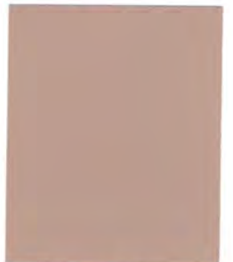
HARVEST GOLD 2 LBS 5084