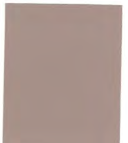
COCOA 2 LBS 6130