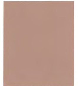
FLAGSTONE BROWN 3 LBS 641