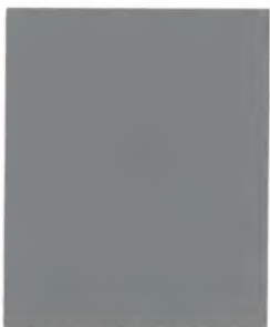
LIGHT GRAY 0.5 LB 8084 * or 2.5 LBS 860