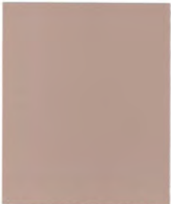
SOUTHERN BLUSH 1 LB 10134