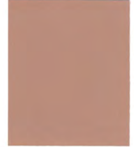
SPANISH GOLD 3 LBS 5084