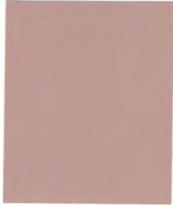
SUNSET ROSE 1 LB 160