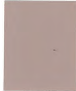
MOCHA 1 LB 6058