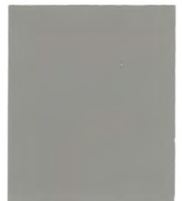
GREEN SLATE 3 LBS 3685