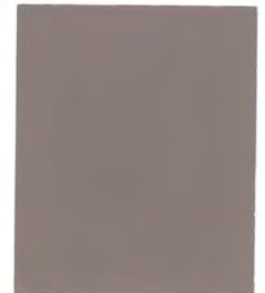
KAILUA 4 LBS 677