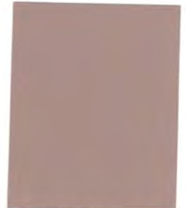
RUSTIC BROWN 2 LBS 6058